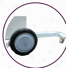
Light Wheels for Easy Maneuverability